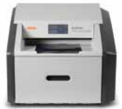
DRYVIEW 5700 Laser Imager