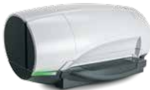
Vita Flex CR System