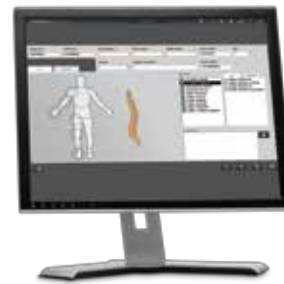
Image Suite V4 Software